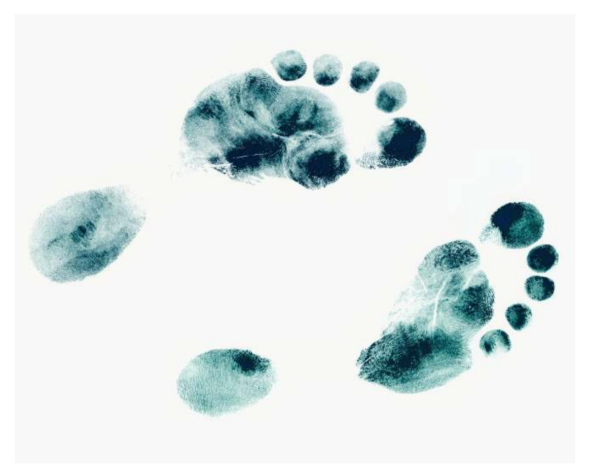
Figure 9 : Footprints – have you looked for yours?

The sections that follow present the "what" and the "how" of the potential watchers with a few hints of "why".